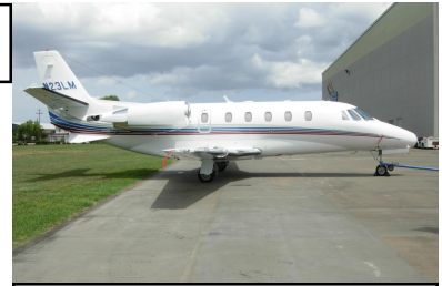
2000 Cessna Citation Excel 560: 2050 TT!

1973 Piper Warrior: Nice. $27,900! 1978 Beechcraft F33C Bonanza: Luxury Aerobatic 4-Place. Loaded and Beautiful! 1997 Cessna 525 Citation Jet: GPS, Storm Scope, well equipped. 2000 Cessna Citation Excel 560: 2050 TT! 2005 Beech King Air C90B Blackhawk: Loaded! Like New!