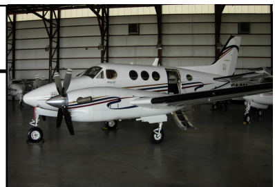
2005 Beech King Air C90B Blackhawk: Loaded! Like New!