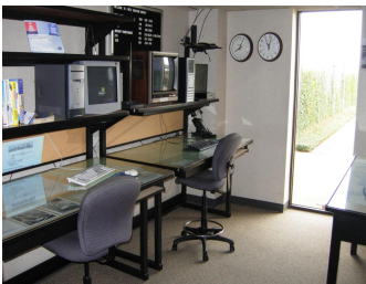
WEST HOUSTON AIRPORT FLIGHT PLANNING AMENITIES

P.O. Box 941789 Houston, Texas 77094-8789 18000 Groschke Rd. Houston, Texas 77084-8789 Phone: 281-492-2130 Fax: 281-492-7028