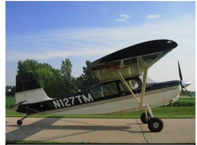
2001 American Champion Scout: Loaded!

AVIONICS (Yellow-tagged) Garmin GDL 69 Weather, King KX155(28) NAV/COM, King KI-209 VOR/ILS Indicator, Collins ADF 650, Indicator and ANT-650A.