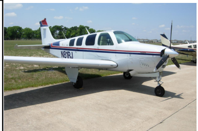
1966 Piper Cherokee 180: Garmin 300 XL, Transponder. Priced to sell!