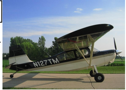
2001 American Champion Scout: 350 TTAE Loaded!

1965 Piper Twin Comanche PA 30: Lots of modifications!