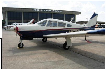
1970 Piper Arrow: Beautiful! Low Engine Time, Autopilot. Recent Paint and Interior.

25% Partnerships for Sale: 2008 Piper Meridian: Loaded!