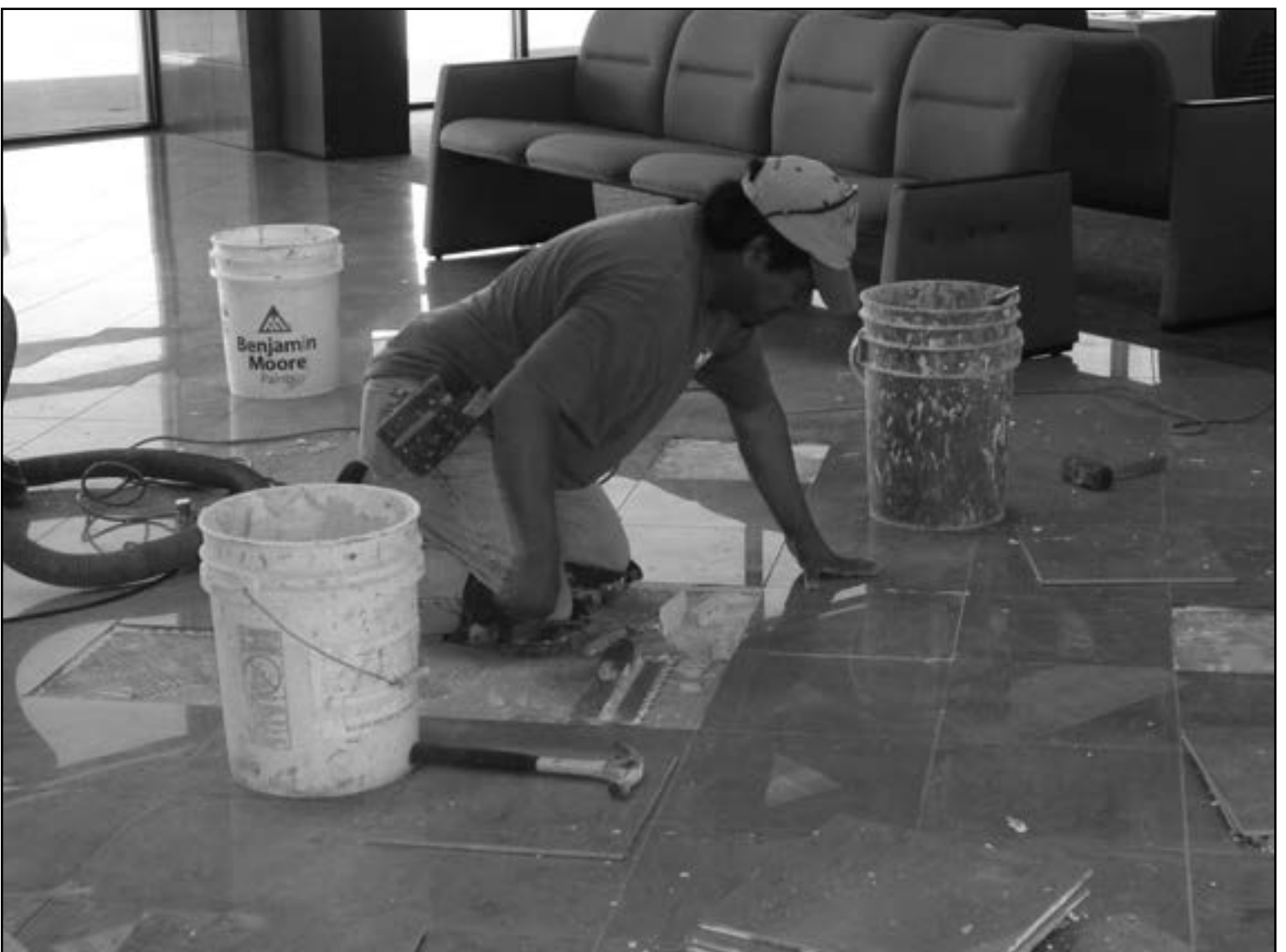
BELOW. Texan Floors Worker puts finishing touches on West Houston Terminal floors for 50th anniversary

This marks the second time Texan Floors has redone the flooring for West Houston Airport and employees are impressed with terminal's updated design. The new terminal features over 30,000 sq ft of flooring from Texan Floors using high quality material including marble and plush carpeting.