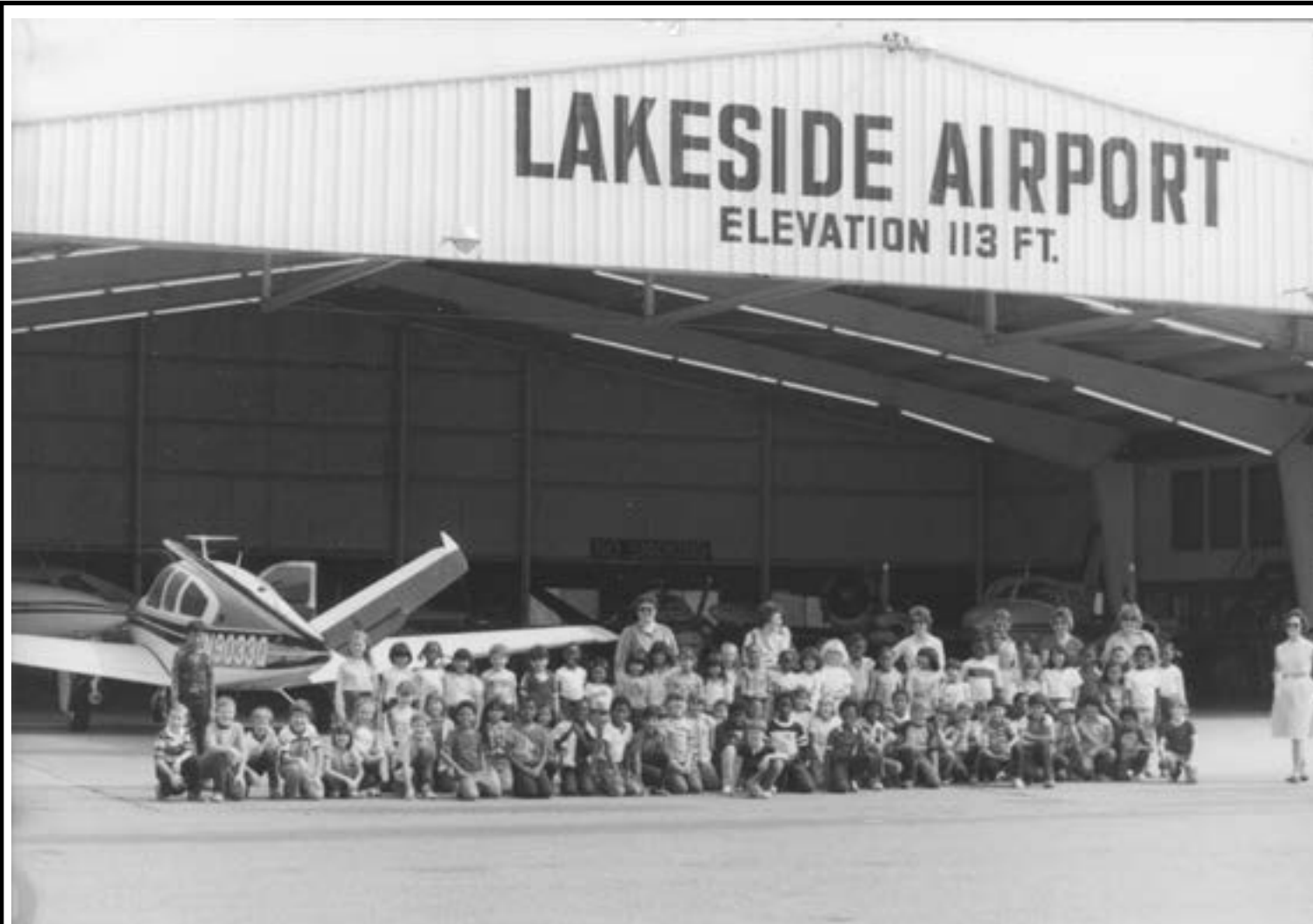
ABOVE. The original airport hangar built when the airport was first purchased in the seventies