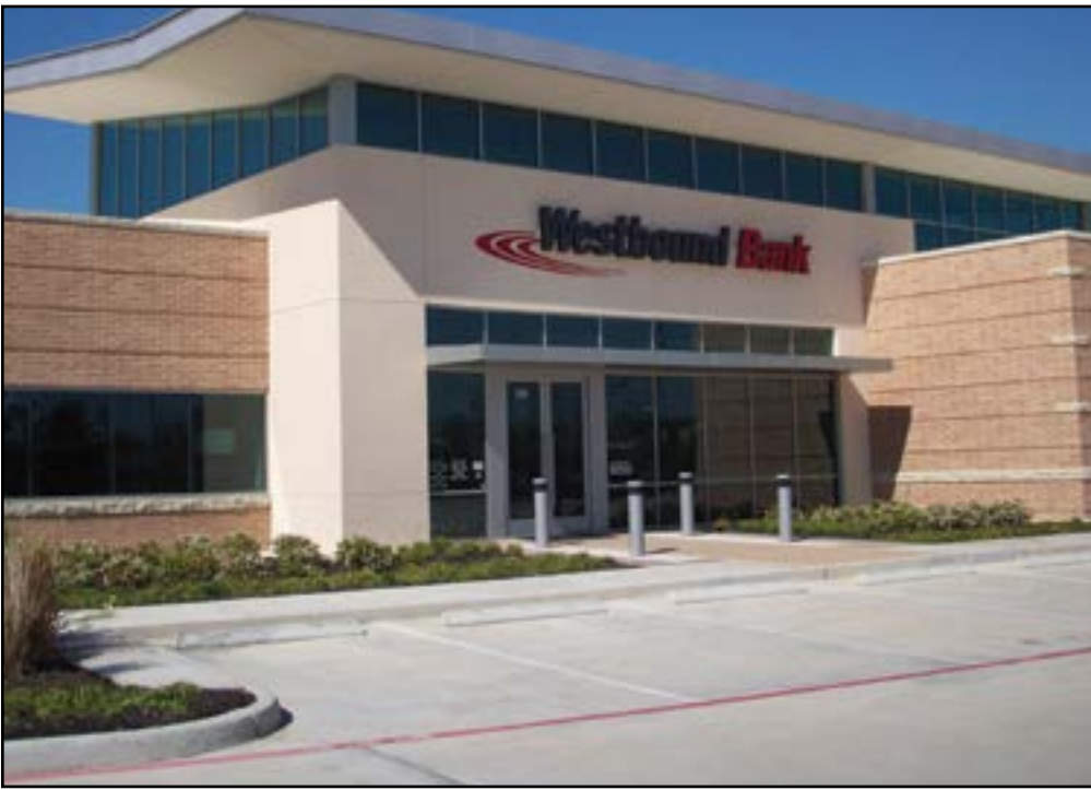
ABOVE. The Katy branch of Westbound Bank off of Grand Parkway