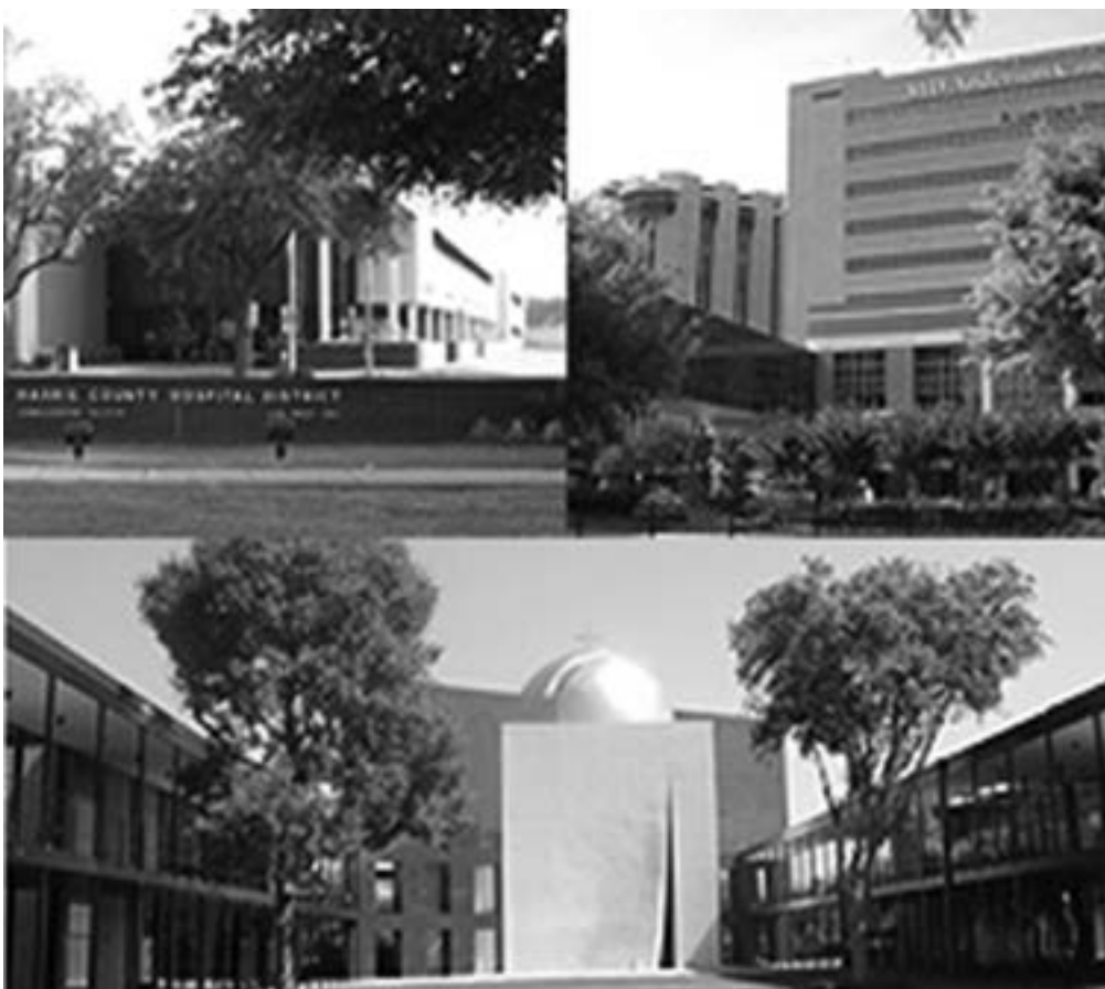
ABOVE. McDonough Engineering has worked on various projects around Houston, TX

INDUSTRIAL • LAND & SITE DEVELOPMENT • TRANSPORTATION • PUBLIC WORKS