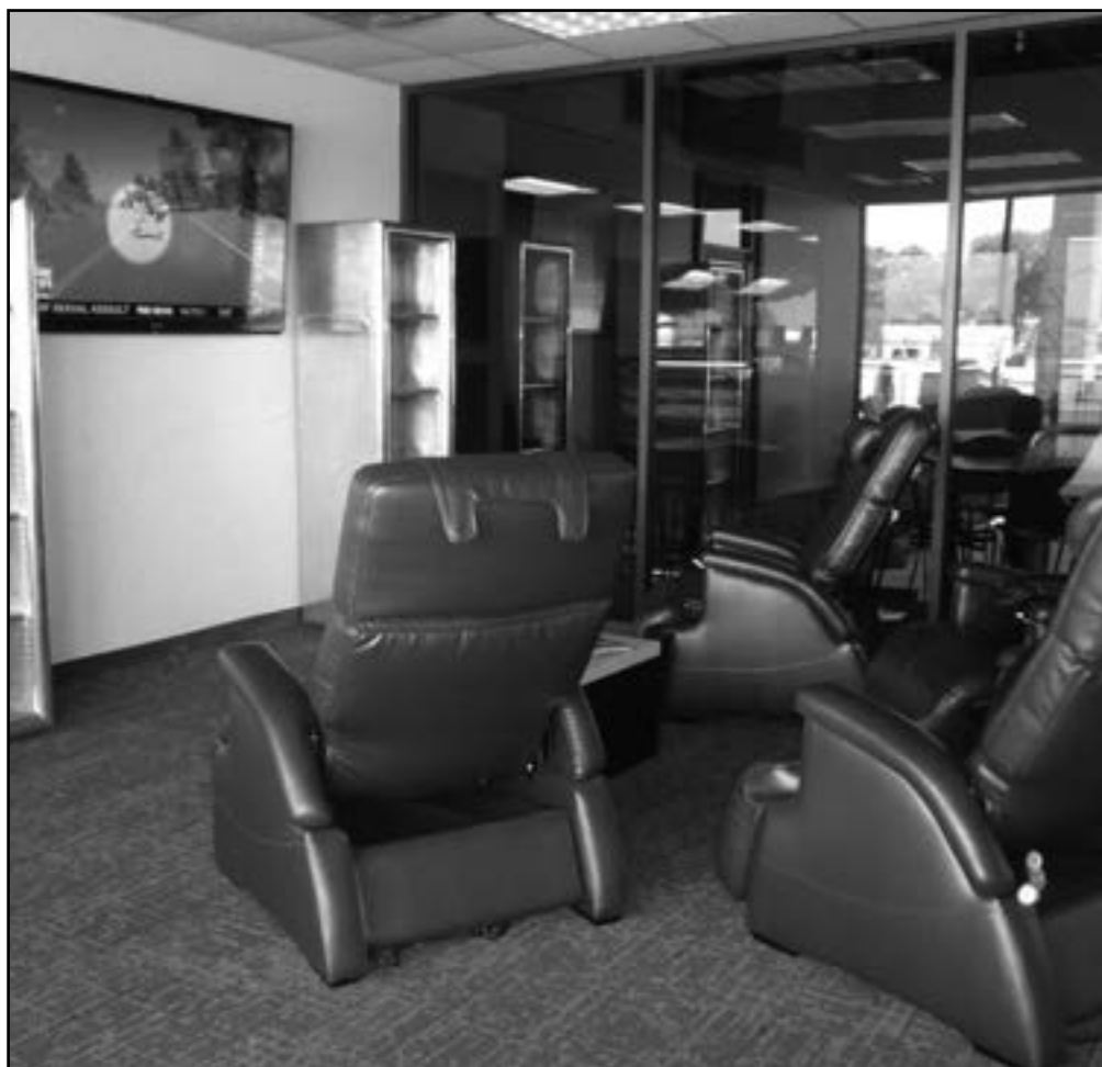
ABOVE. The 'Very Important Pilot' lounge at West Houston