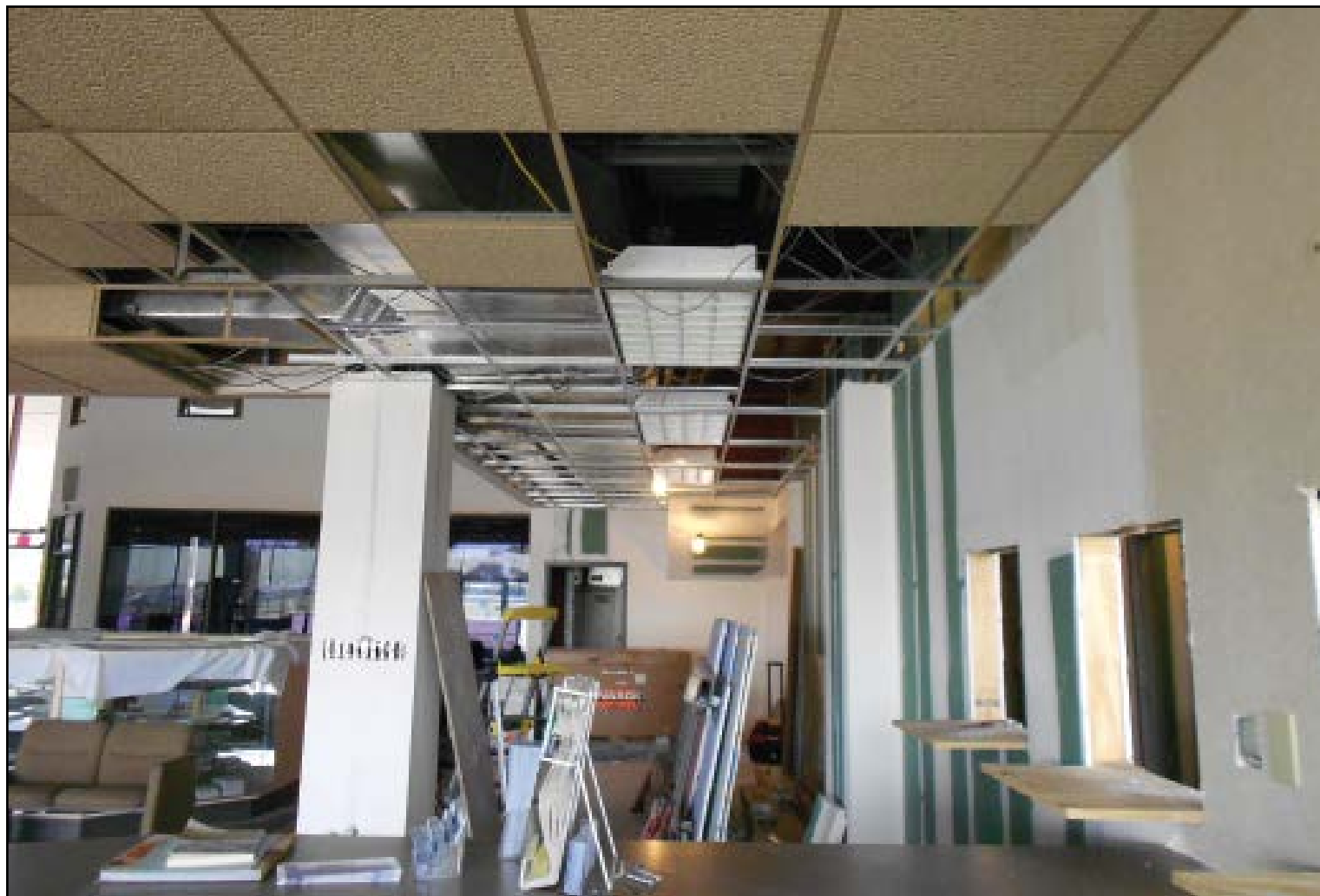
ABOVE. Recent renovations on West Houston's terminal gutted the existing building built in 1984

Belfort Instrument Company has been a leading provider of weather instruments to government, professional meteorology and aviation markets for over 130 years.