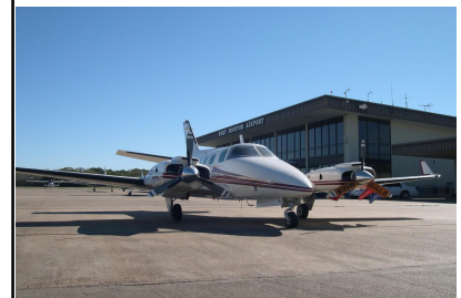
1977 Beech BE60 Duke: Garmin 750 GTN Touch screen. Financing available. Loaded!

Free: Coffee, Ice, Popcorn Authorized AeroNav FAA Chart Dealer!