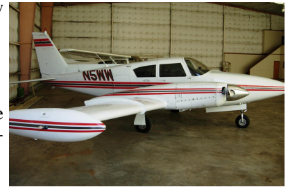
1965 Piper Twin Comanche PA 30: Lots of modifications! Make offer.

COMPLETE FACILITIES AVAILABLE AT IWS: ▪ COMMUNITY HANGARS ▪ ▪ T-HANGARS ▪ T-COVERS ▪ TIEDOWNS ▪ ▪ LARGE HANGARS FOR RENT ▪ ▪ SMALL OFFICES FOR RENT ▪