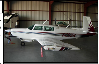
1981 Mooney M20K: Turbo, 3-Bladed Prop, Deiced, Garmin 430 GPS.

1995 Thorp T-18: Nice. Fast! Homebuilt buy owner. 200MPH!! $39,900.