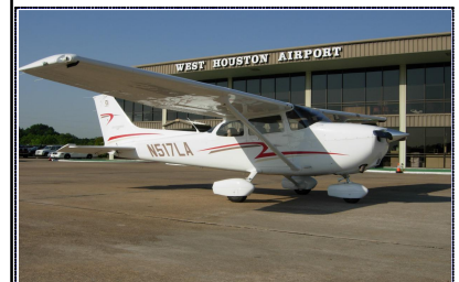
2009 Cessna Skyhawk 172S: G1000, Digital Audio Panel. Tax Incentive!