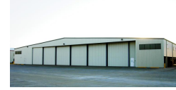
Hangar G4/5 281-492-2130