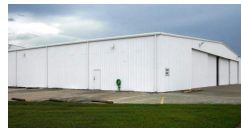
Hangar C2 281-492-2130

See our website for details www.westhoustonairport.com