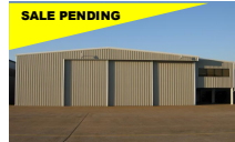
Hangar B3 281-492-2130