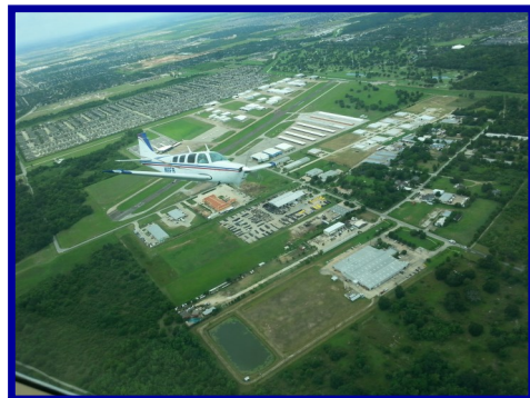
Jay Burris in 6FB while in route for lunch with friends.

conscious of our airplane's noise level and avoid high RPM's of our controllable propellers until well into the final approach and placing the Base leg of the traffic pattern closer to the runway. Spacing the Downwind Leg farther from the runway will enable you to "Turn Base" earlier.