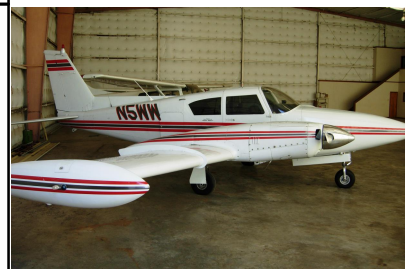
1965 Piper Twin Comanche PA 30: Lots of Mods!