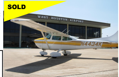
1982 Cessna 182R: Immaculate aircraft. Low engine time. Fresh annual. Always hangared! Estate Sale.

COMPLETE FACILITIES AVAILABLE AT IWS: ▪ COMMUNITY HANGARS ▪ ▪ T-HANGARS ▪ T-COVERS ▪ TIEDOWNS ▪ ▪ LARGE HANGARS FOR RENT ▪ ▪ SMALL OFFICES FOR RENT ▪