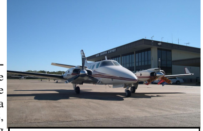
1977 Beech BE60 Duke: Garmin 750 GTN Touch screen. Financing available. Loaded!

Cirrus Partnership Opportunity: Three owners who have owned airplanes together since 2005 are looking to add a 4 th . 2007 Cirrus SR22 G3, loaded with options, including A/C. For details call 713-515-7126