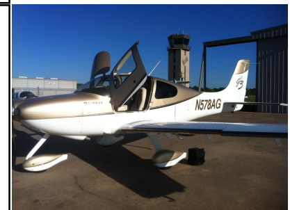
2007 Cirrus SR22 G3: Loaded with options, including A/C. Call 713-515-7126 for partnership details.

Free: Coffee, Ice, Popcorn Authorized AeroNav FAA Chart Dealer!