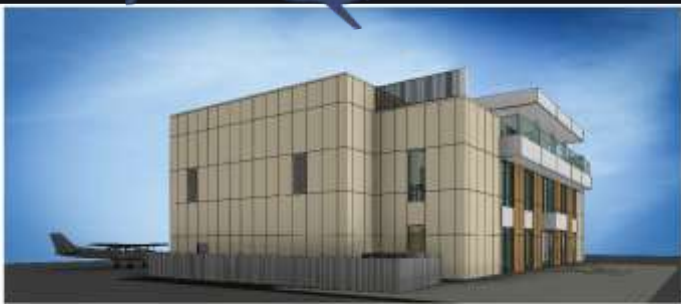
1 AEROVILLA 3D VIEW 1