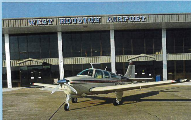
1978 Beechcraft F33A Bonanza

MAKE OFFER TRADES ACCEPTED FINANCING AVAILABLE BONUS DEPRECIATION! LEASEBACK AIRCRAFT AVAILABLE!