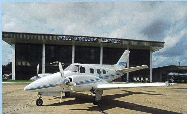
1979 Beechcraft B60 Duke - Low Low Time!