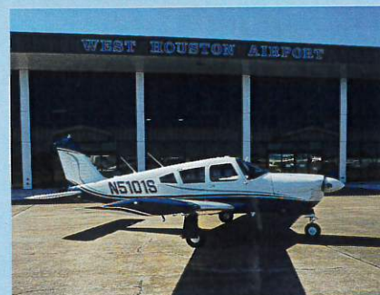
1971 Piper Arrow